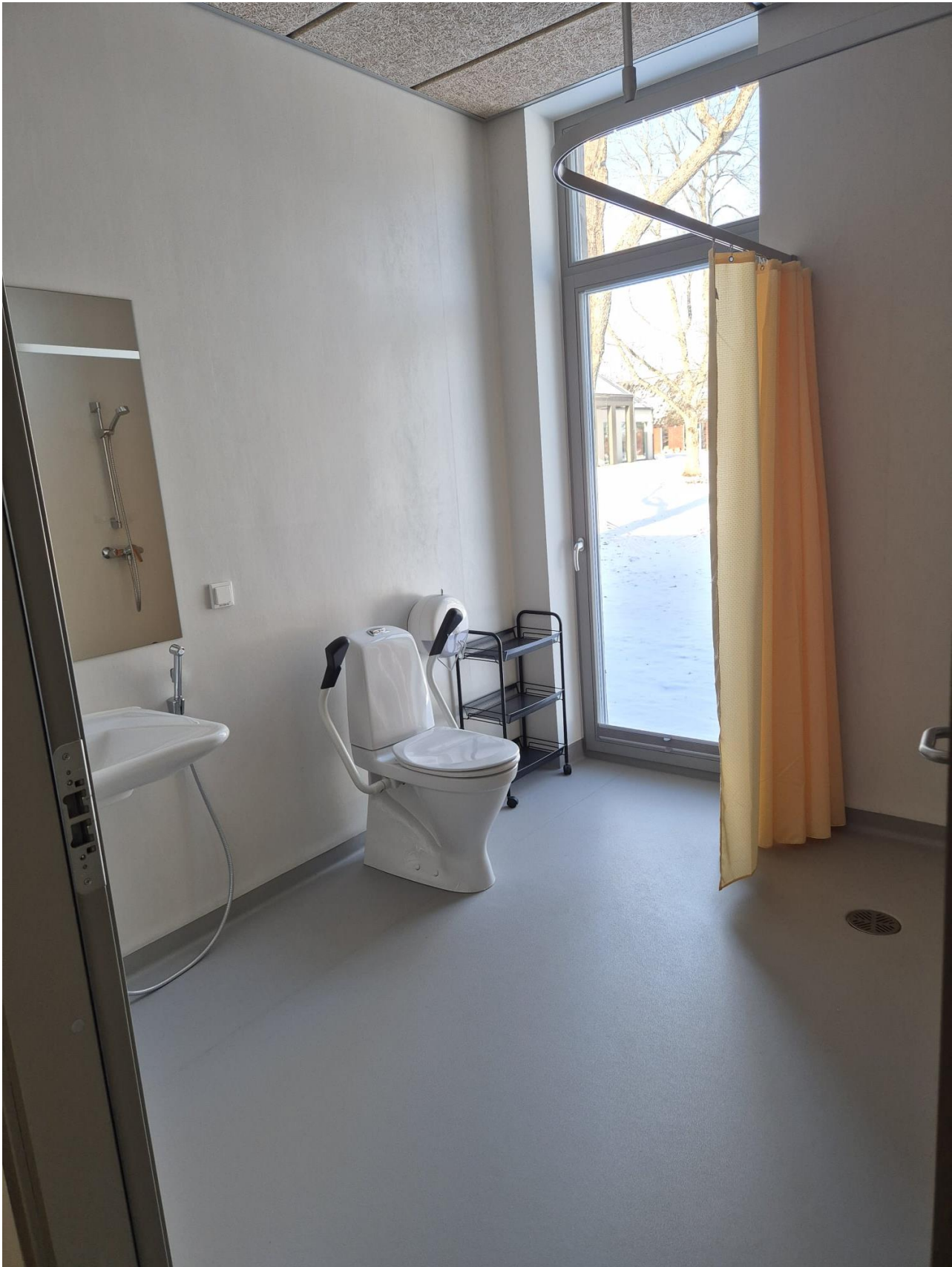
All toilets/showers in the accommodation are designed the same way – for mobility impaired there are no barriers.