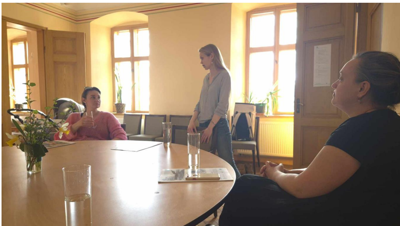
Meeting room in the historical building